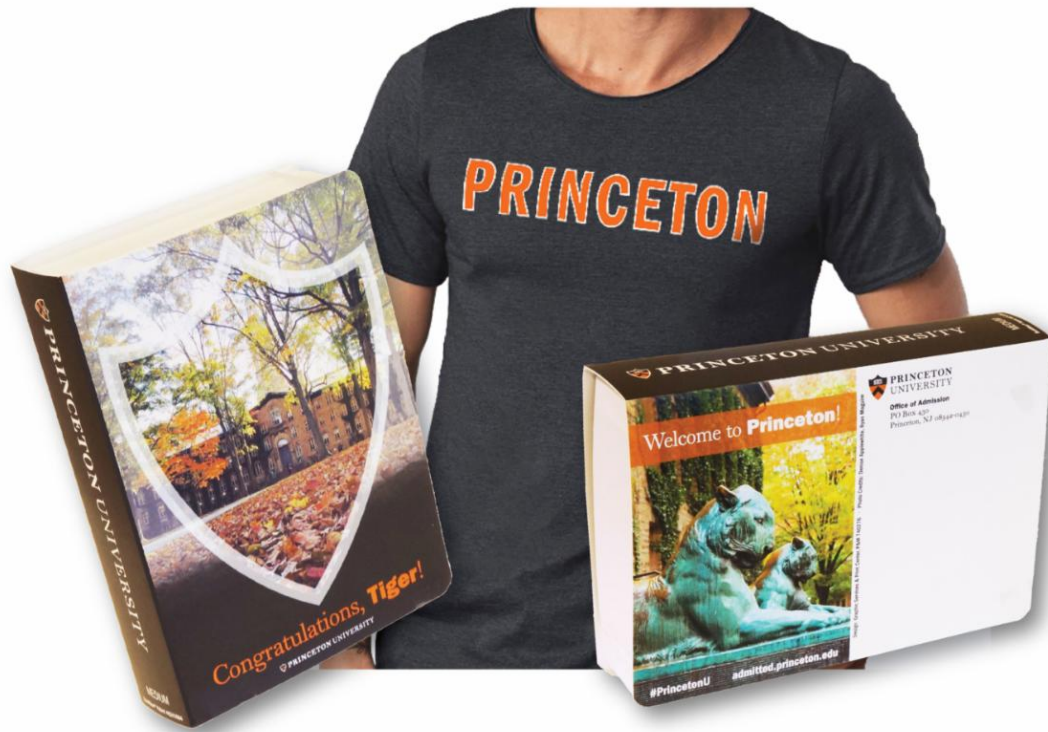
Printing Princeton shirts prior to compressing in "books".

Reorders are a friendly face to see. I think this is the sixth year for Princeton using BookWear® to say "CONGRATULATIONS" and "WELCOME" for their new accepted students. Princeton mails out thousands of these books to fill their enrollment. It's fun for the students and effective for Princeton. A true Win-Win!